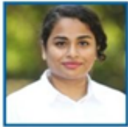
Vaidehi Vihari Alkesh Dinesh Mody Institute of Financial and Management Studies